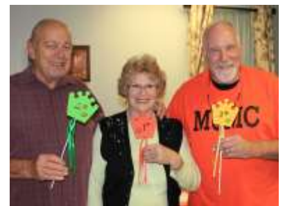
Left: Girl Scouts help unload pumpkins, 2016. Above: Chili Cook-off winners, at the 2014 Pumpkin Festival.