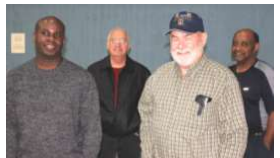
Marvin men served wounded warriors dinner, 2014