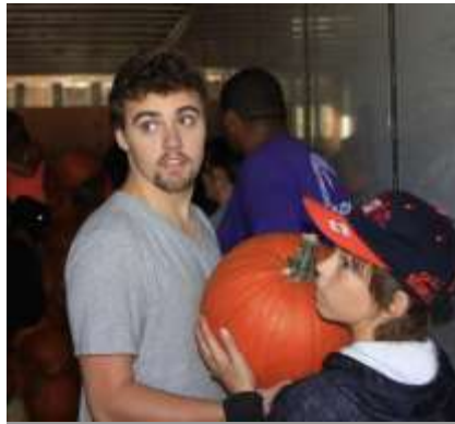
All ages help unload pumpkins, 2016. Volunteers include the Emmaus Community, Paine College, and Doctors Hospital.

We are in the midst of our many fall festivities. The popular Pumpkin Patch, which has been headed by Marvin Men for seven years, funds church missions. The Marvin Women organize the annual craft festival, this year renamed MarvinGanza. And of course there's the Fall Festival with its much anticipated trunk-or-treat and chili cook-off. The community we serve looks forward to each of these events.