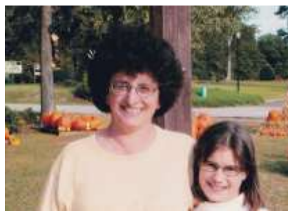
Pumpkin Patch, 2004