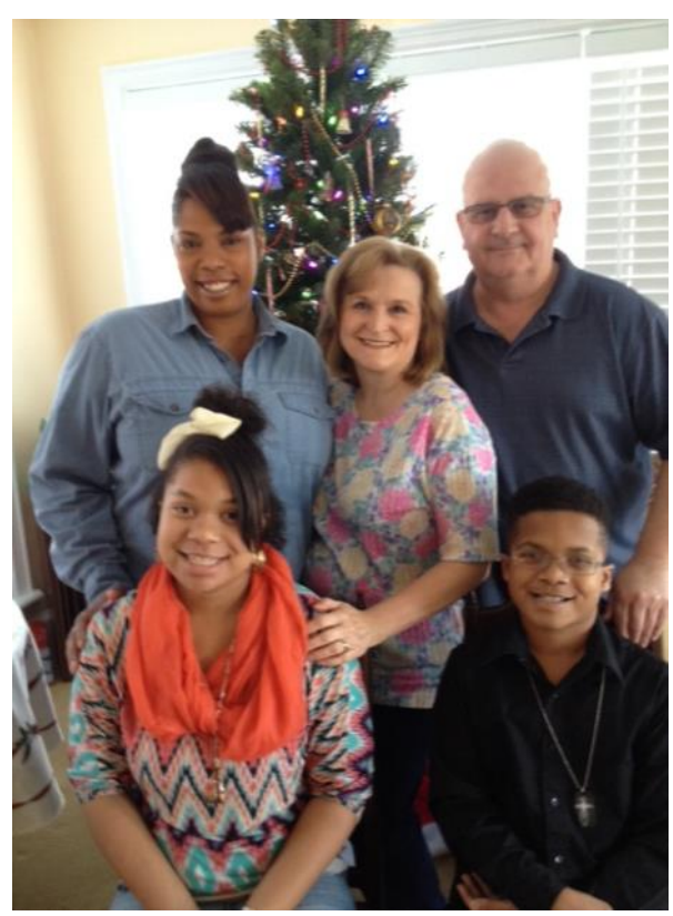
"Point your kids in the right direction when they're old they won't be lost." Proverbs 22:6 Msg

The Skeltons are their "church grandparents." They attend all the children's performances . . . Encourage homework and service . . . Share holiday dinners . . . Sleepovers . . . And do all the things grandparents do.