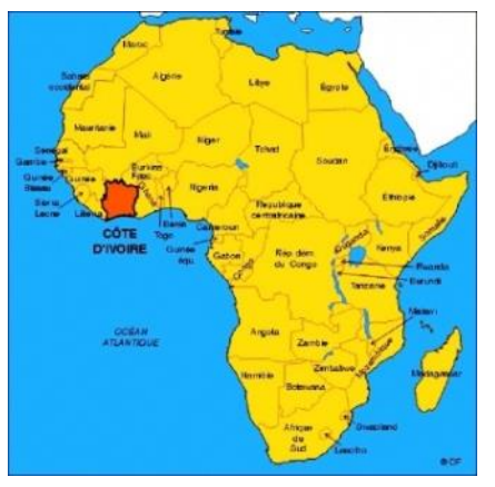
Ty LaValley cycled over 500 miles in 11 days to 68 churches getting the word out about his Scouting mission to Côte d'Ivoire.