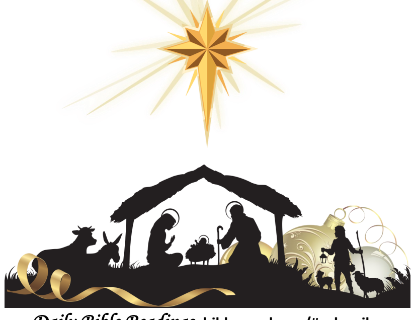
Daily Bible Readings bible.usccb.org/#subscribe